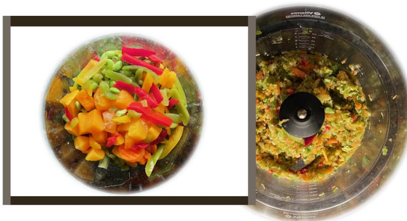
Vegetables (peppers, lima beans, brussels sprouts, edamame, butternut squash, asparagus, and carrots) mixed in food processor.

Using a food processor, this mix of vegetables becomes a rice consistency.